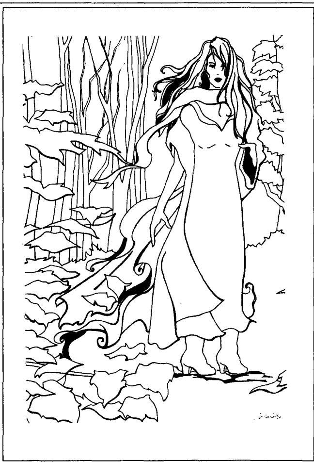
Illustration for backdrop of a play By Sandra Zally

Critique at 5:30, Business meeting 6:30, Monthly Demonstrator 7:15, Refreshments Meetings are the 4th Monday each month - Guests are Welcome